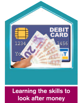
Learning the skills to look after money