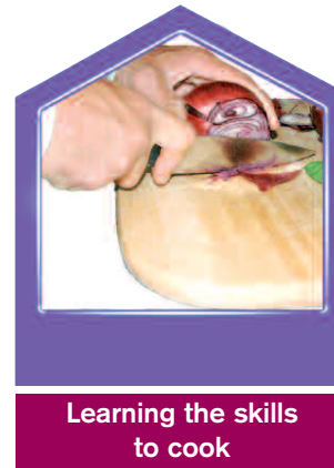
Learning the skills to cook