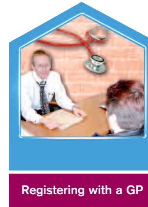
Registering with a GP