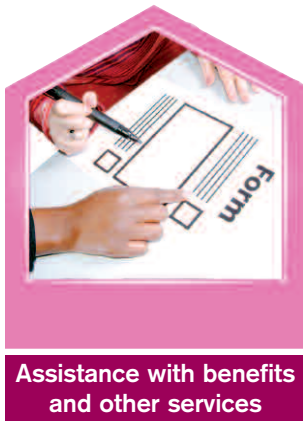
Assistance with benefits and other services