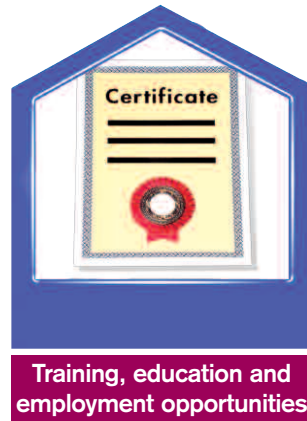
Training, education and employment opportunities