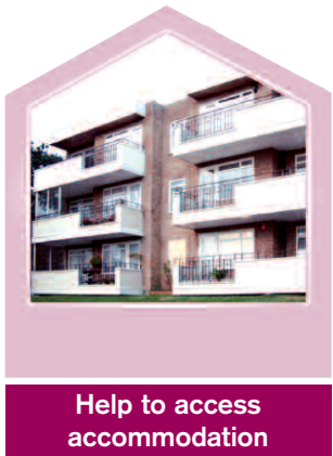
Help to access accommodation