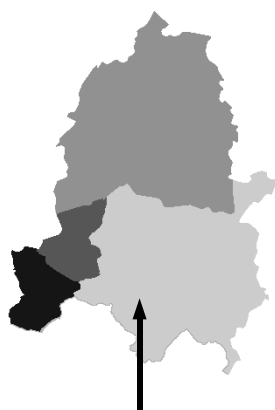
North Notts Health area